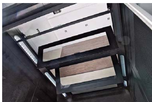
Roof top panel type-A