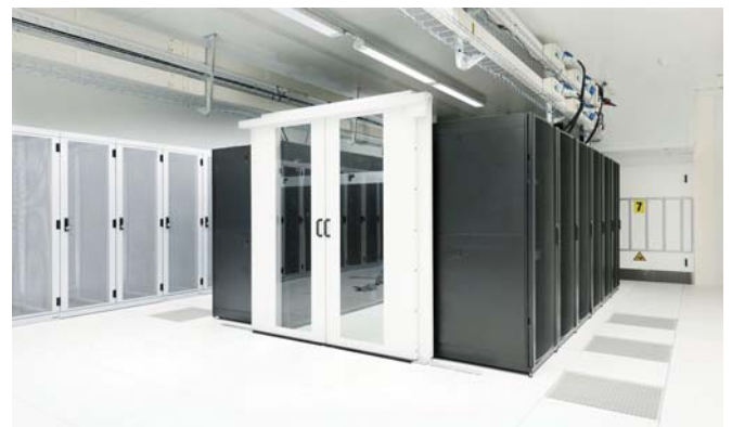
Containment type-B (factory)