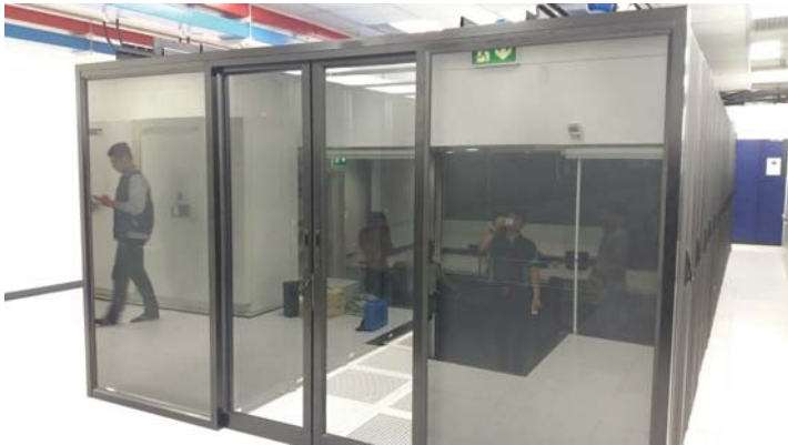
Containment type-A (custom)