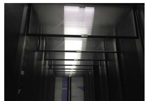
Roof top panel type-B